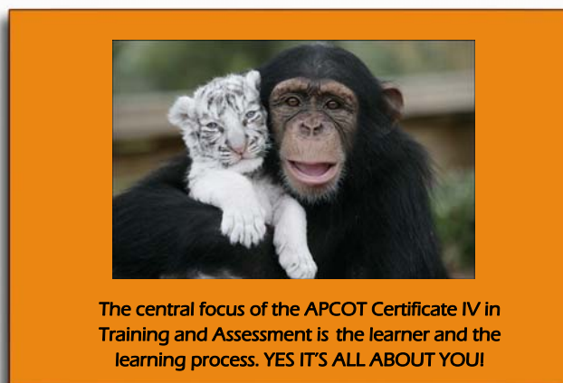
The central focus of the APCOT Certificate IV in Training and Assessment is the learner and the learning process. YES IT'S ALL ABOUT YOU!